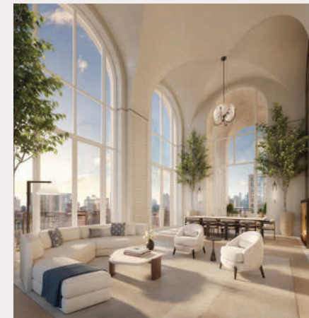
FOUR SEASONS, BOGOTÁ