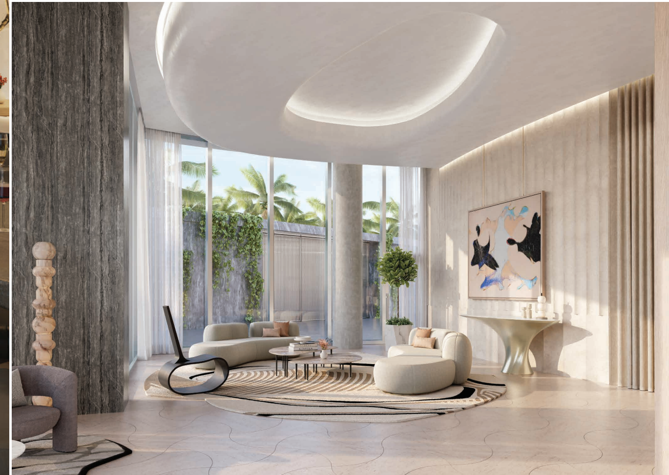
TOP: READING LOUNGE; BOTTOM: FORMAL SITTING LOUNGE