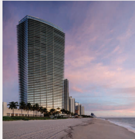
RESIDENCES BY ARMANI CASA, SUNNY ISLES