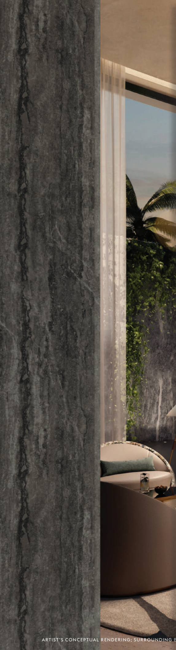
ARTIST'S CONCEPTUAL RENDERING; SURROUNDING B