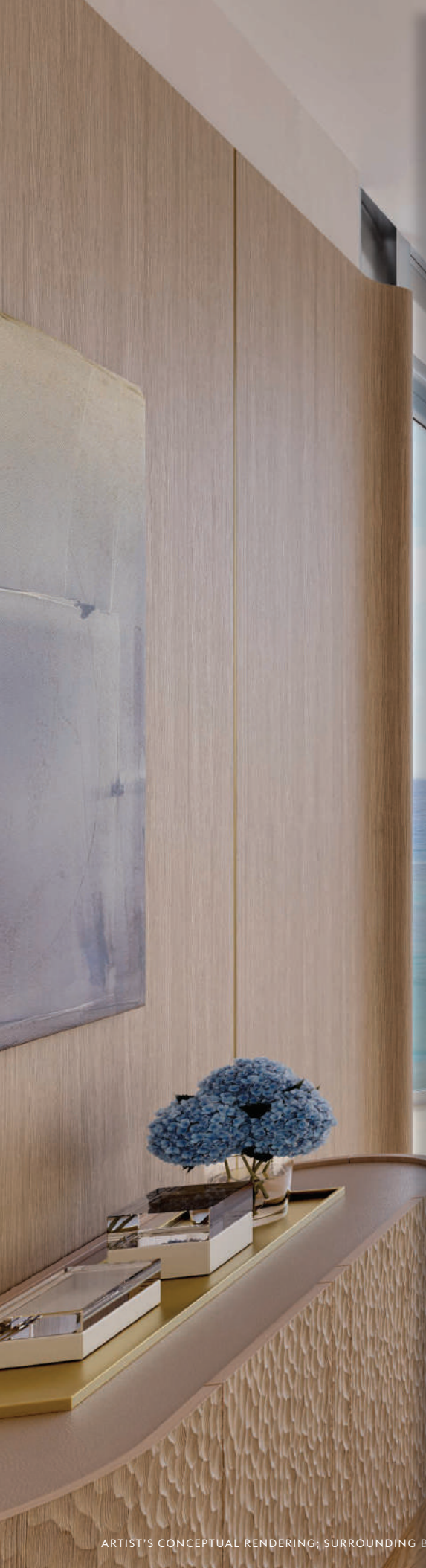
ARTIST'S CONCEPTUAL RENDERING, SURROUNDING B