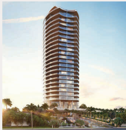
FORTÉ, WEST PALM BEACH

Founded in 1979, Related Group has enhanced skylines with iconic development characterized by innovative design, enduring quality and inclusive living. Through groundbreaking partnerships with world-renowned architects, designers and artists, Related redefines urban environments on a global scale, fostering distinctive dynamic communities and symbolic landmarks. The firm is one of the largest privately owned businesses in the U.S., with a development portfolio in excess of $40 billion in 40 years.