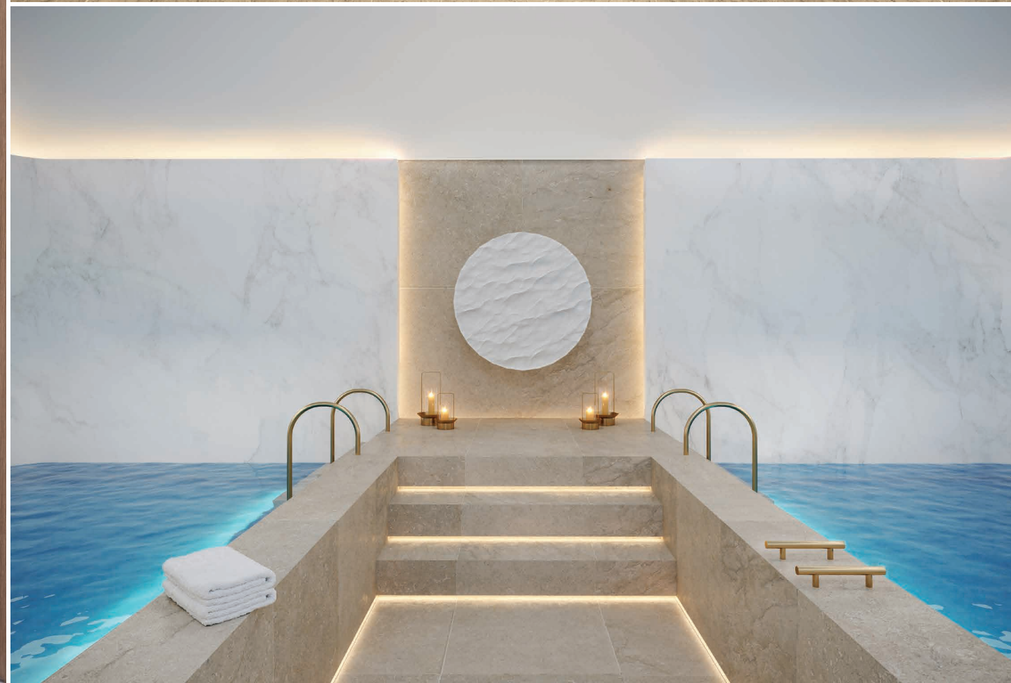
TOP: HAMMAM; BOTTOM: HOT AND COLD PLUNGE POOLS