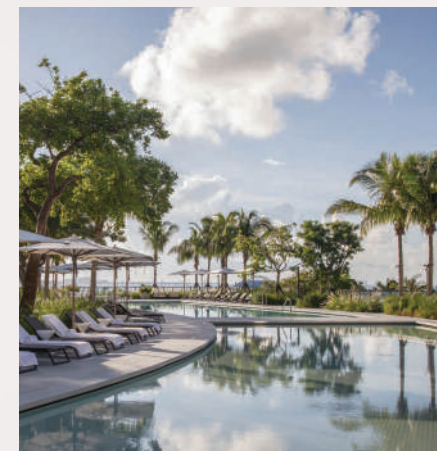
PARK GROVE, MIAMI